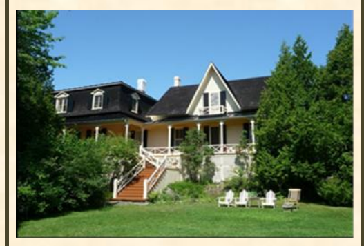
B&B Les Rochers (Rivière-du-Loup)