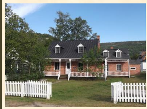
Maison Molson-Beattie (Tadoussac)