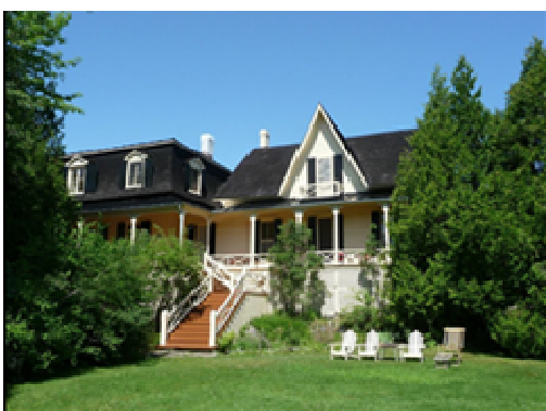
Les Rochers B&B

Other improvements will be made to Les Rochers B&B this spring. 2016 will also be another special year for this property as we will mark the 20 th anniversary of the opening of Les Rochers as a B&B.