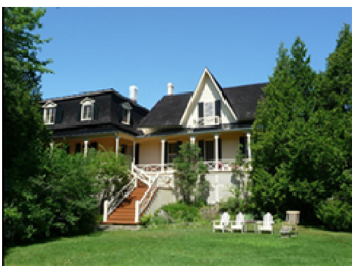
Les Rochers B&B

Other improvements will be made to Les Rochers B&B this spring. 2017 will also be another special year for this property as we will mark the 150 th anniversary of the Canadian Confederation.