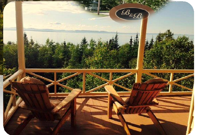
View of the St. Lawrence River from the veranda at Les Rochers

For more information about our activities, please visit our website : www.hcq-chq.org and our Facebook page : www.facebook.com/HeritageCanadienQuebec .