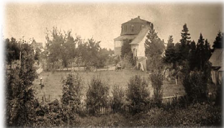
Villa Les Rochers, Sir John A. Macdonald's summer residence near Rivière-du-Loup, c. 1885.

The Canadian Heritage of Quebec (CHQ) is pleased to announce the online release of the exhibition " Villa Les Rochers: Summer Residence of Sir John A. and Lady Macdonald ", presented on Virtual Museum of Canada's (VMC) website ( www.virtualmuseum.ca ). This new web space, hosted in VMC's site, reveals unknown facets of the Macdonalds' daily life.